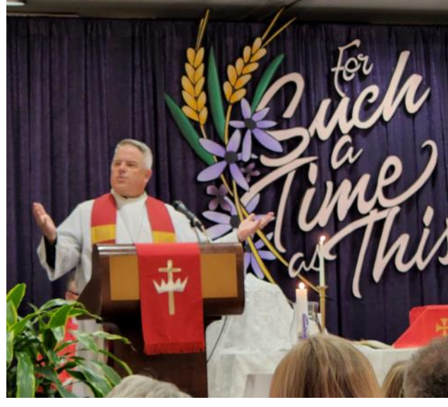
<sup>14</sup> For if you remain silent at this time, relief and deliverance for the Jews will arise from another place, but you and your father's family will perish. And who knows but that you have come to your royal position for such a time as this?" Esther 4:14