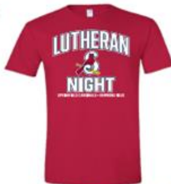
Shirts available in Adult S-XXXL *Additional $2 for XXL and XXXL

f /SpringfieldCardinalsBaseball @sgf_cardinals @springfield_cardinals