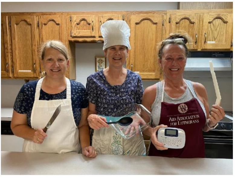
The butcher, the baker the crooked candle stick and label maker.