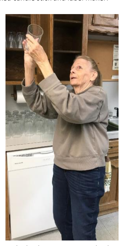
The kitchen inspector is checking our work.