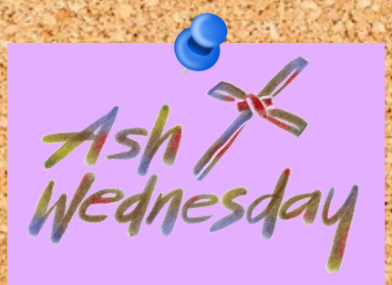
March 6 at 6 p.m.