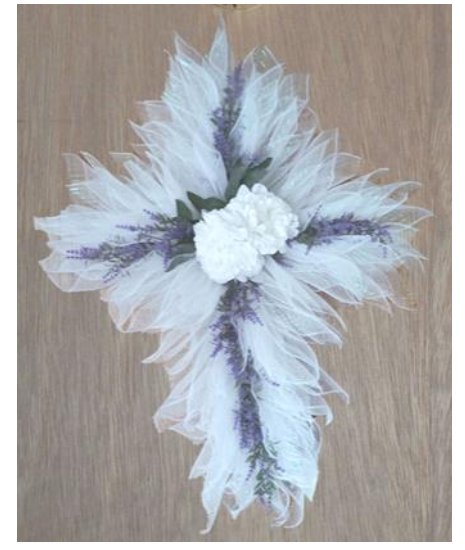
Thank you to Vicki Stauch for handcrafting this beautiful cross.

The boxes, for these items, are located on the table just inside the front door of the church.