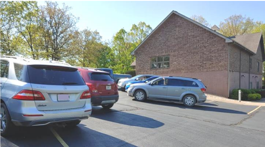
Members and visitors gathered at the church parking lot for worship services on Sunday, April 28.

April 26 th was a new first for Peace Lutheran Church. After weeks of waiting for equipment to be shipped, experimenting with how the equipment worked and trying to find a microphone that we could use, we held the first ever drive through service in our parking lot. We had 42 people receive communion in their automobiles. This was a slightly abbreviated service, since we need to work on how to transmit our music, but we had a beautiful day, great sermon and communion. Thanks to all who attended. Assuming we will need to maintain “social distancing” and refrain from gathering in large groups, this will be our Sunday service for the near future. Come join us for our Sunday Service in the parking lot!