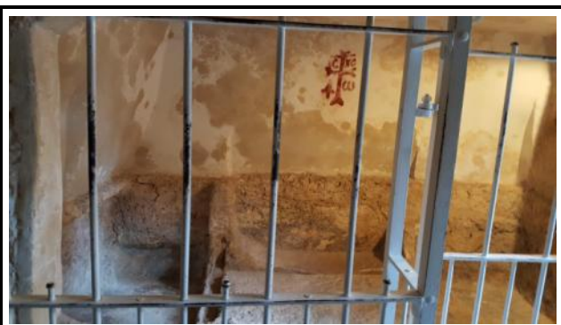
The tomb where Jesus was laid outside of Jerusalem.

You see, Jesus doesn't like filled tombs. He likes empty tombs! By early Sunday morning Joseph's tomb was not "probably empty" like the one near Orlando; it was absolutely empty! The word of the Easter morning angel says it all: "Why do you seek the living among the dead? He is not here, but has risen. Remember how He told you, while He was still in Galilee, that the Son of Man must