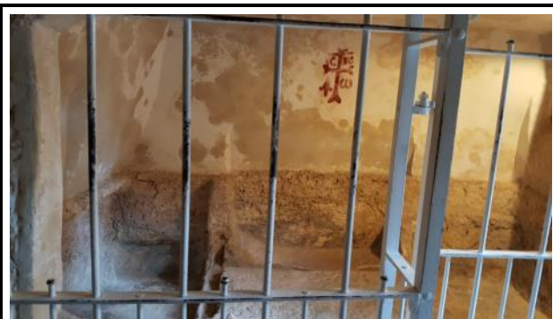
The tomb where Jesus was laid outside of Jerusalem.

You see, Jesus doesn't like filled tombs. He likes empty tombs! By early Sunday morning Joseph's tomb was not "probably empty" like the one near