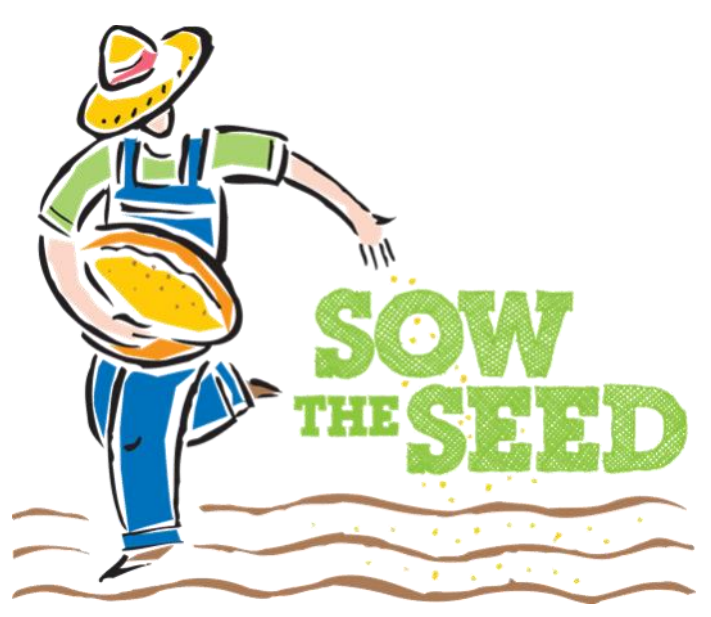
From Every One His Witness