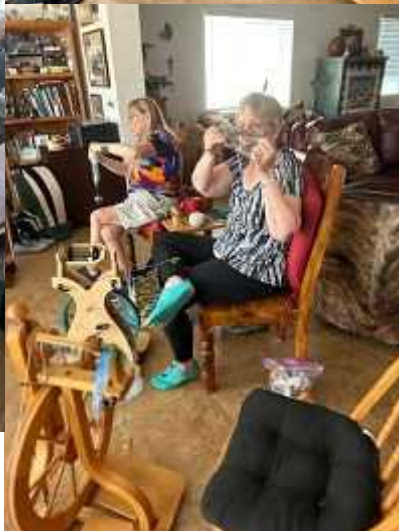
Spinning Study Group ~ fun in the summer