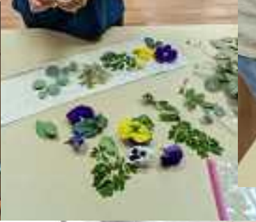
Eco-Dyeing Workshop with Merry Warner