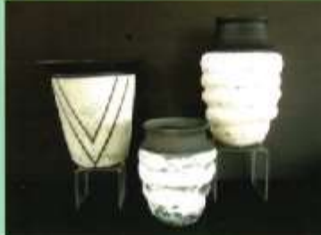
Mariah Clearwater mariahclearwater.com