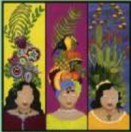
Geri Bringman flickr.com/photos/geribringman