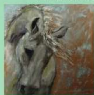
Brenda Peo brendapeoart.com