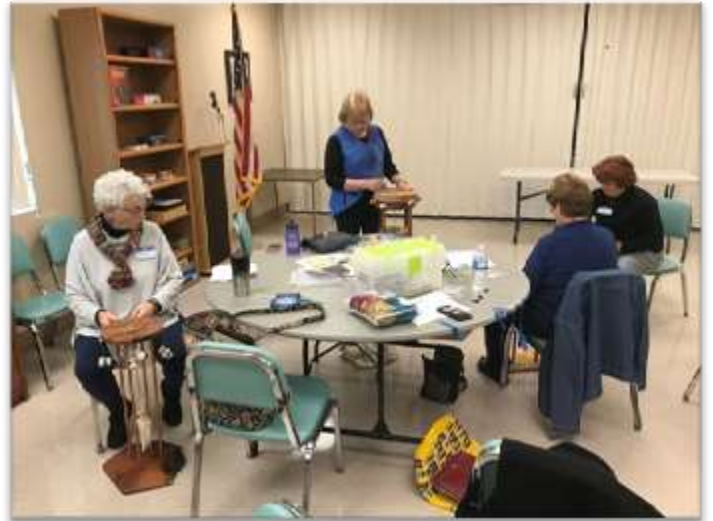
Photos above & below: The new Marudai study group getting the “hang of it!”