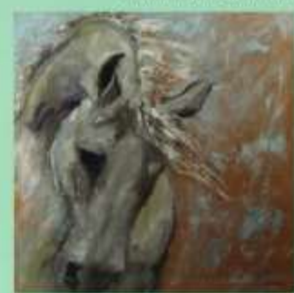
Brenda Peo brendapeoart.com