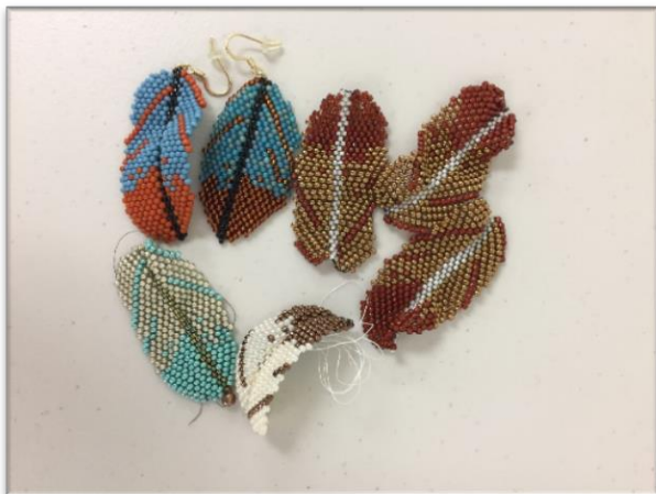
The latest project from the Beading study group.