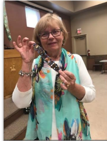
Left and below: Members share at Show and Tell.