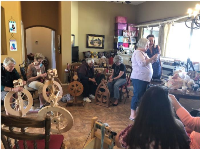
Above: Spinning study group