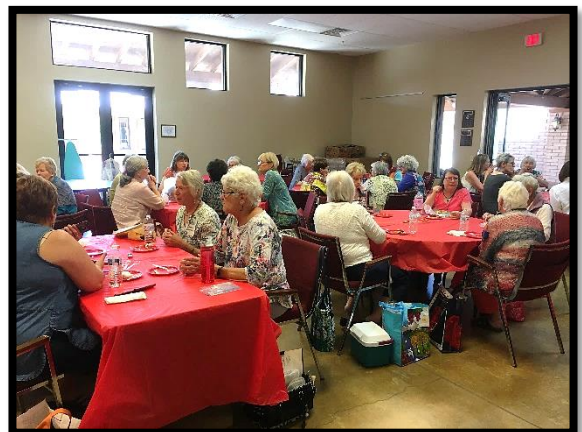
Everyone was happy at the April Stash Sale & Brown Bag Lunch!