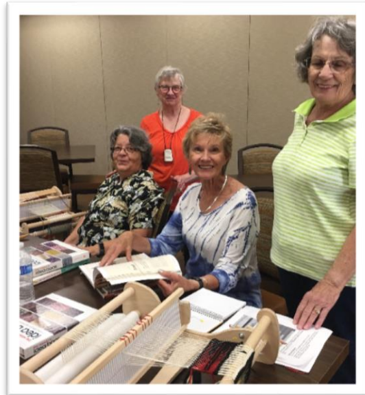
Above: Rigid Heddle study group

Some of you are starting to leave for the summer. This is to remind you that for the December Opportunity Baskets , we're encouraging you to donate finished items that you've made as well as items from your stash. So, over the summer, keep the Guild in mind as you work away at your chosen art form - - and pick out something wonderful that you're ready to share.