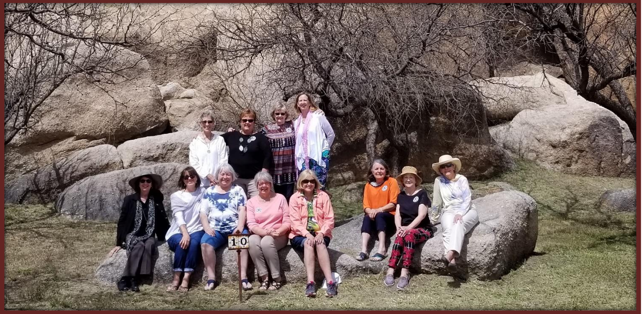
Guild members stop to enjoy the scenery in Dagoon, while on the Amerind Foundation Museum trip in March.