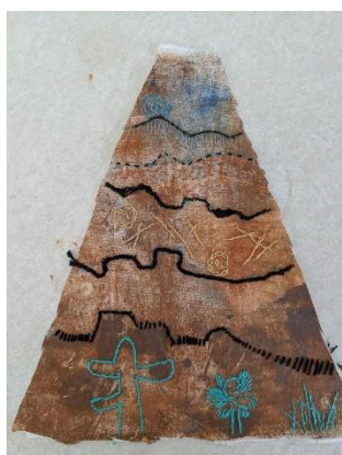
Peggy McGaughey - Tiny pocket purses & hand-dyed modules with embroidery stitches