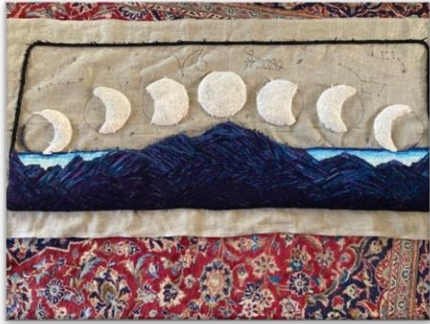
Sue Miller – rug hooking - “work in progress”