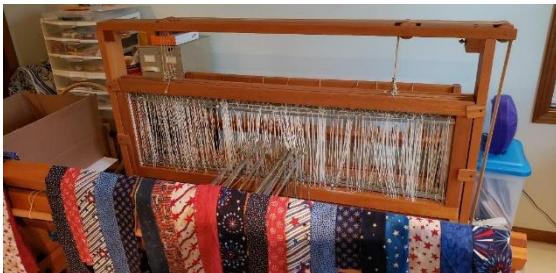
Lea Gough – partially warped loom and Patriotic Quilt strips partially sewn together