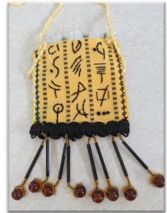
Left: Debra Brown – rigid heddle fabric and dyed fabric beads listing extinct birds.