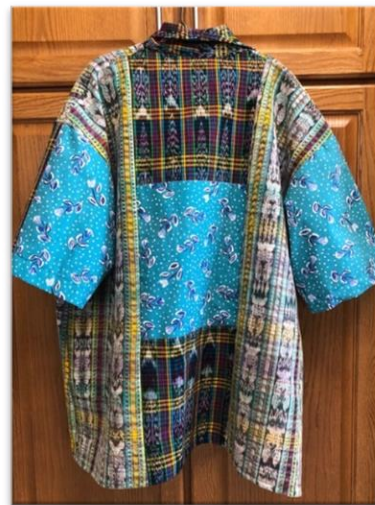
Marie Gile – Kimono, “it will be completed by stamping a dark golden or orange color on the turquoise areas.”