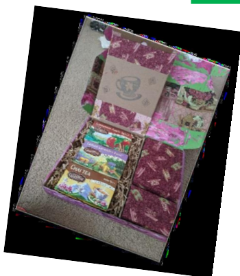
Cigar box art by Ann Pyper