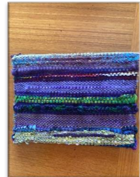
Jane Tempel – Front & back of 2 (of the 15) rigid heddle woven pouches (TAG donations). Below right: rigid heddle woven valence.