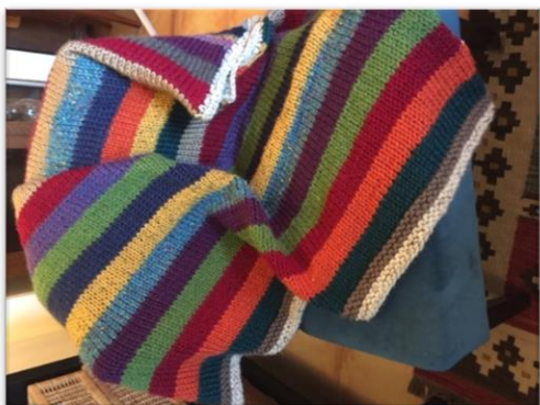
Blankets & Color Shifting Shawl - Margalis Fjelstad