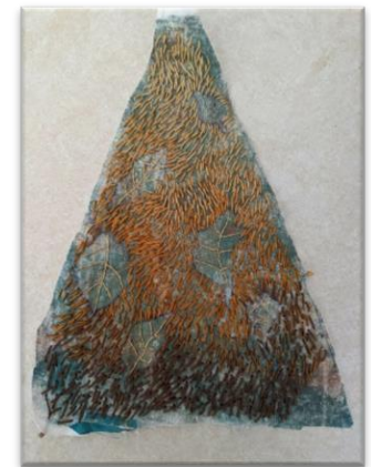
Above: Tiny pocket purses & hand-dyed modules with embroidery stitches - by Peggy McGaughey