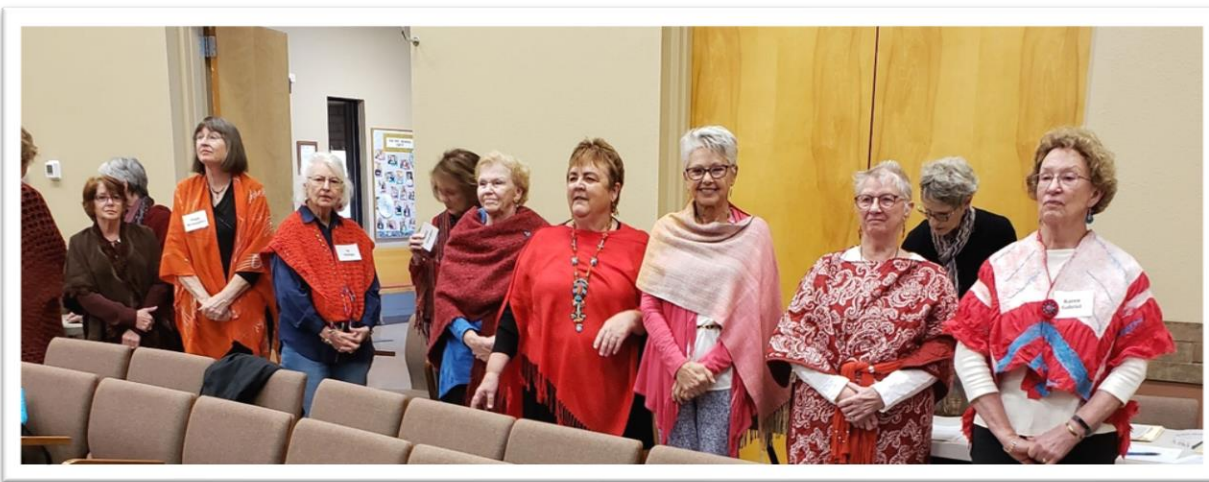
The Red Ruanas ----- Ready to Roll!