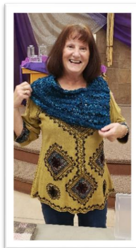
Left: A happy Silent Auction bidder & winner!