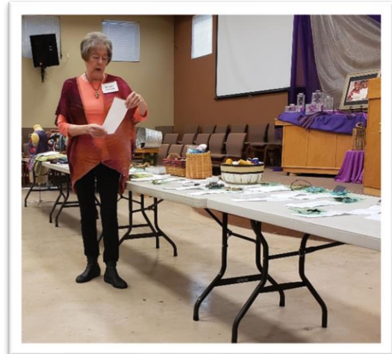
Silent Auction & Opportunity Baskets