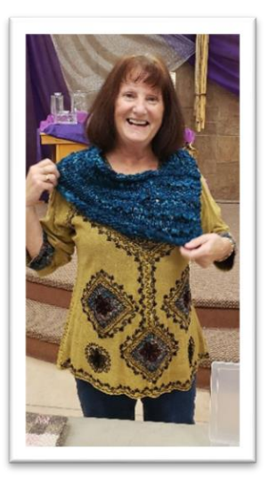
Left: A happy Silent Auction bidder & winner!