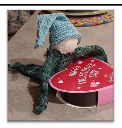
Valley Fiber Art Guild