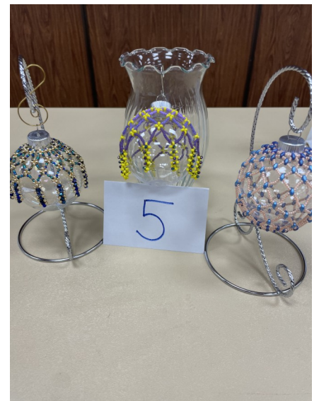
Beading Study Group