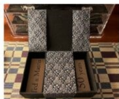
Curt Dornberg Paper-lined Box

Weaving • Spinning • Dyeing • Felting • Knit • Crochet Basketry • Beading • Braiding • Wearable Art