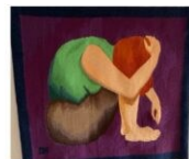
Olga Neuts Refugee Tapestry