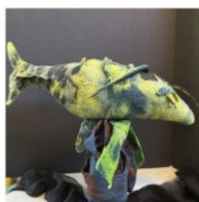
Sally Hall Diving Down Felted Fish