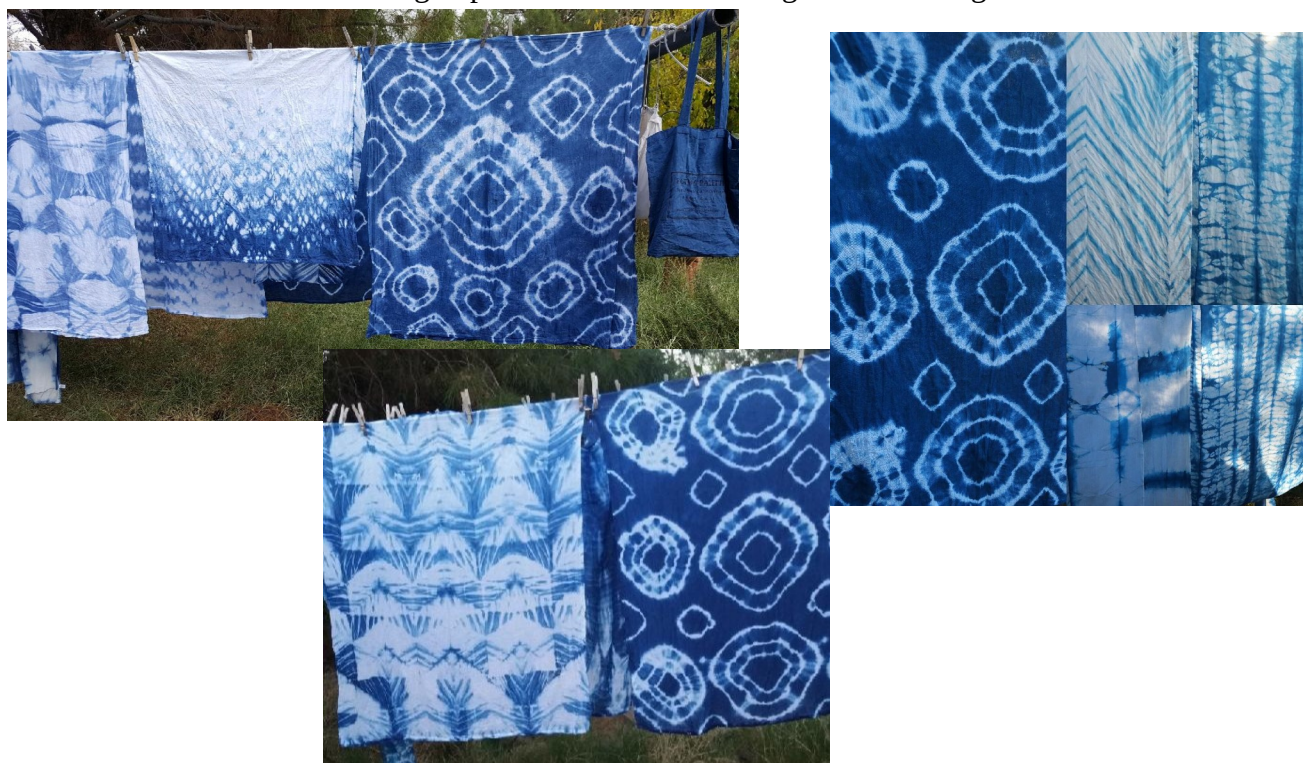
Exhibit: Cumbi – Textiles, Society and Memory in Andean South America

There will be information and sign up sheets available at the general meeting.