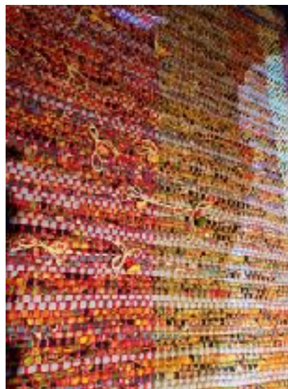
One of our new member's rag rug embellished with beads made into a wall hanging.