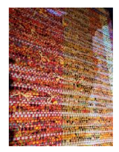
One of our new member's rag rug embellished with beads made into a wall hanging.