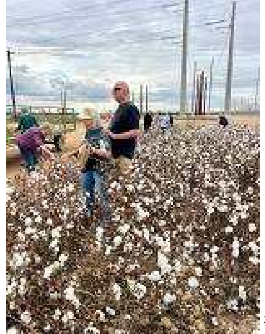
Photographs from the Caywood Farms tour