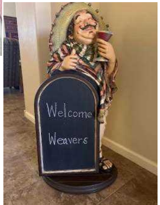
New greeter for the Weaving Study Group at Casa del Lobos