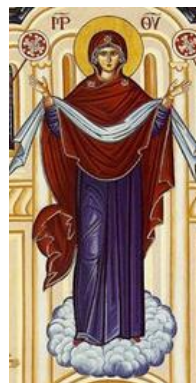
St. Mary Byzantine Catholic Church (Under the Holy Protection of the Mother of God)

An icon of St. Nicholas of Myra, Bishop of Myra. He is depicted from the chest up, facing forward. He has a round, balding head with a halo, a full white beard, and a stern expression. He is wearing a dark blue or black robe with a wide, patterned border. The border features a repeating geometric design of interlocking squares and diamonds, with Greek letters (Phi, Pi, Chi, Rho) inscribed within them. He holds a large, ornate book in his left hand, which is decorated with a grid of small white dots and blue crosses. His right hand is raised, holding a small cross. The background is a solid, warm gold color. In the top left corner, there is a small, faint inscription in Greek. In the top right corner, the name 'NIKÓ' is written in large, bold, black capital letters, with 'ΛΑΟ' and a small 'ς' below it.