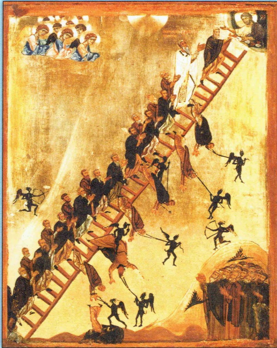
Icon of the the Ladder of Divine Ascent