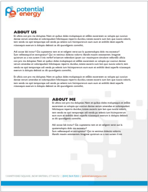
About Us/Bio Sell Sheet*