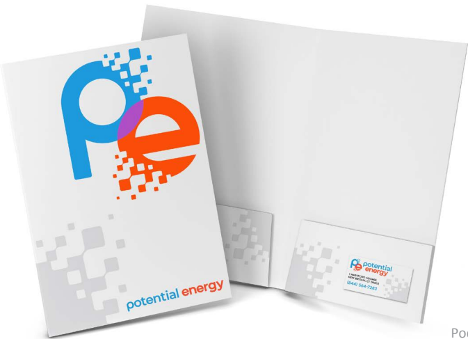
Pocket Folder* (delivery mechanism)