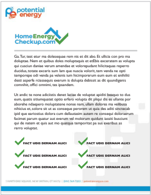
Package Sell Sheet*