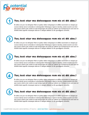
Top 5 Questions Sell Sheet*