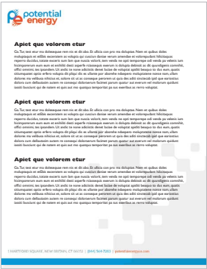
Savings and Benefits Sell Sheet*