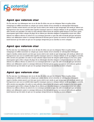
Testimonials Sell Sheet*