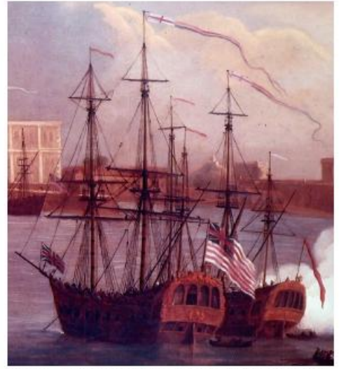
North American Vexillological Association