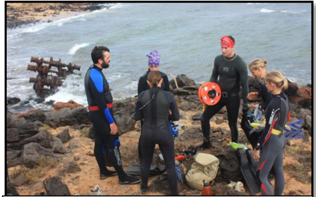
Divers ready on coastline.

Once on Lana`i, the team established their remote base at historic Federation Camp, a series of beach shacks built in the 1920's by local plantation workers originally from the Philippines. Camp supplies were staged by barge from Oahu, and then supplemented by daily truck runs up to Lana`i City for water and ice. The open camp served as a base for the daily five mile round-trip hike (too rough for ATVs) along the coast to the wreck site. All equipment needed for data collection was packed in to the work site. Fortunately, the ship's heavy wooden timbers along the coast, and the heavy winches, boiler and double compound steam engine components were sufficiently close to shore to allow for free diving techniques. Unfortunately, the strong trade winds, funneled between the islands of Moloka`i and Maui, blew consistently hard during the ten-day field work, and the resulting surf and long shore current challenged the team. Following an early breakfast in camp, divers hit the trail at 6:30 AM, arriving back at camp at 3:00 PM for several hours of map work, translating the measurements from their slates onto the detailed site plan. Evenings were spent by the gas lanterns or campfire, or on the beach under the bright array of stars.