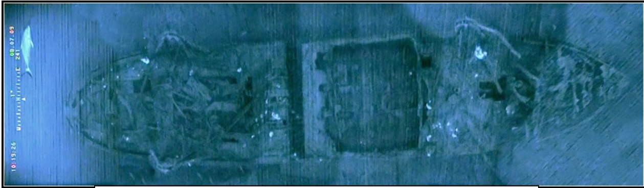
Remains of the YP-389.

In September, a National Marine Sanctuary -led research team announced that it had located and identified the remains of the YP-389, a U.S. Navy patrol boat sunk approximately twenty miles off the coast of Cape Hatteras, N.C., by a German submarine during World War II. The YP-389 was built at the Fore River Shipyard as the fishing trawler Cohasset in 1941 and converted into a patrol craft shortly after the United States entered the war.