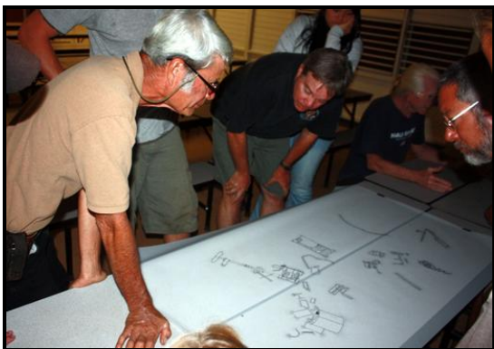
Public examining site plan.

The residents of Lana`i were actively engaged in this survey. Student presence in Lana`i City (population 2500), and visits to the Lana`i Heritage Center, Lana`i Elementary and High School, and the final public presentation (very well received) were a strong part of the project. The team was assisted in shoreline trilateration work by nine students from Lana`i Elementary and High School. Several other local folks also made the long and exposed hike out to the site, sharing their knowledge of coastal resources and Lana`i history with the group. See: http://sanctuaries.noaa.gov/maritime/expeditions/lanai/welcome.html for additional information.