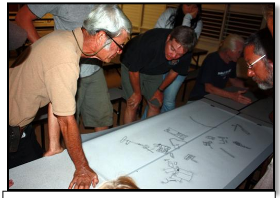
Public examining site plan.

challenged the team. Following an early breakfast in camp, divers hit the trail at 6:30 AM, arriving back at camp at 3:00 PM for several hours of map work, translating the measurements from their slates onto the detailed site plan. Evenings were spent by the gas lanterns or campfire, or on the beach under the bright array of stars.