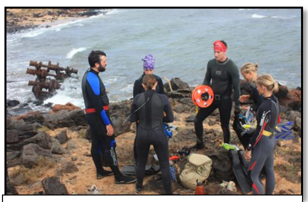
Divers ready on coastline.

Once on Lana'i, the team established their remote base at historic Federation Camp, a series of beach shacks built in the 1920's by local plantation workers originally from the Philippines. Camp supplies were staged by barge from Oahu, and then supplemented by daily truck runs up to Lana'i City for water and ice. The open camp served as a base for the daily five mile round-trip hike (too rough for ATVs) along the coast to the wreck site. All equipment needed for data collection was packed in to the work site. Fortunately, the ship's heavy wooden timbers along the coast, and the heavy winches, boiler and double compound steam engine components were sufficiently close to shore to allow for free diving techniques. Unfortunately, the strong trade winds, funneled between the islands of Moloka'i and Maui, blew consistently hard during the ten-day field work, and the resulting surf and long shore current