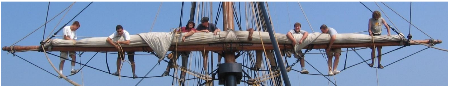
Class of 2009 Learning the Ropes

The Erie Maritime Museum in cooperation with Allegheny College, Edinboro University, Mercyhurst College, Mt. Holyoke College, Gannon University, and Walsh University has created an undergraduate history course on Oliver Hazard Perry’s flagship, the Brig Niagara . The inaugural course took place this past May and was highly successful. The consortium would like to expand this offering to include schools throughout the United States and Canada. It is seeking professors willing to offer the experience to their students by sponsoring this course on their campus. It is hoped that there will be one to three students from any given school that would sign up per year. A syllabus is available, as well as the itinerary from the 2010 voyage. However, the consortium is completely open to course modifications and itinerary addition(s) to suit your institutional requirements. A planning meeting is tentatively set for August 30 th (conference call).