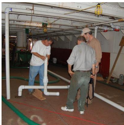
Restoration efforts within the Clyde of Falls.

Since then, the ship has deteriorated markedly. Her owners hired a marine surveyor in 2008, and the decision was made to scuttle the Falls . However, the non-profit Friends of Falls of Clyde group purchased the vessel from Bishop Museum and, having initiated their own surveys, is making a concerted effort to save the ship. Closed to the public, she remains down-rigged and de-masted, alongside Pier 7 at Honolulu Harbor. The current internal survey, supported by the Friends group, Hawaii's Clean Islands Council, and San Francisco Maritime National Historic Park, is being done in preparation for planned dry docking and hull stabilization work. For more information, contact friendsoffallofclayde.org .