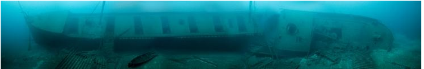
The shipwreck of the freighter Norman is one of nearly 200 shipwrecks in and around Thunder Bay on Lake Huron

The 2013 NASOH Conference held in Alpena, Michigan 15-18 May drew seventy participants from around the country. The theme of Maritime Borderlands and Cultural Landscapes generated 42 papers presented over the course of three days. A trip on the Lady Michigan glass bottom boat carried participants to view shipwrecks of Thunder Bay National Marine Sanctuary, and Maritime Landscape tour of the area took conference goers to several lighthouses and ports. Of course the awards dinner (see book awardee list in the newsletter) and several receptions allowed ample time for NASOH members to catch up, and permitted students and non-members to network and find out more about the organization. The NASOH Council Meeting and Business Meeting were also integrated into the schedule. Financially, the conference was a success (in the black), even with a lower than average attendance. Thunder Bay National Marine Sanctuary was delighted to host the event and to showcase our facilities and resources here in Northeast Michigan. If you were not able to join us in Alpena in 2013, you still have the opportunity to visit the Freshwater Seas in 2014, as the Conference will be held in Erie, Pennsylvania this coming year. See page 10 for additional information.