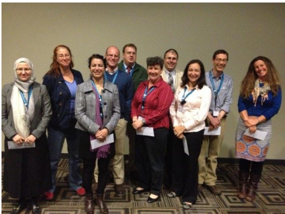
Chad Smith Travel Grant Awardees

The 2013 NASOH Conference held in Alpena, Michigan 15-18 May drew seventy participants from around the country. The theme of Maritime Borderlands and Cultural Landscapes generated 42 papers presented over the course of three days. A trip on the Lady Michigan glass bottom boat carried participants to view shipwrecks of Thunder Bay National Marine Sanctuary, and Maritime Landscape tour of the area took conference goers to several lighthouses and ports. Of course the awards dinner (see book awardee list in the newsletter) and several receptions allowed ample time for NASOH members to catch up, and permitted students and non-members to network and find out more about the organization. The NASOH Council Meeting and Business Meeting were also integrated into the schedule. Financially, the conference was a success (in the black), even with a lower than average attendance. Thunder Bay National Marine Sanctuary was delighted to host the event and to showcase our facilities and resources here in Northeast Michigan. If you were not able to join us in Alpena in 2013, you still have the opportunity to visit the Freshwater Seas in 2014, as the Conference will be held in Erie, Pennsylvania this coming year. See page 10 for additional information.