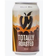
Totally Roasted Vander Mill