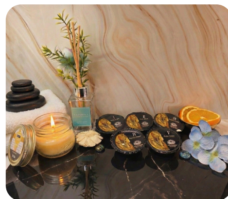
THE 24K MAGIC

*Additional charges apply for extra length, intricate designs, or embellishments