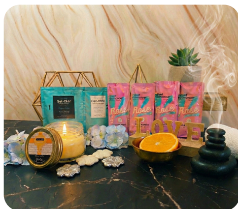
THE ORGANIC JELLY