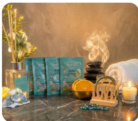
THE DETOX BOMB SPA