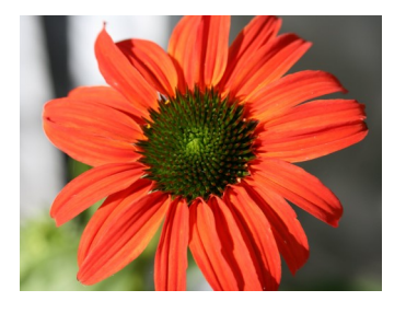
Volume 33 Issue 4