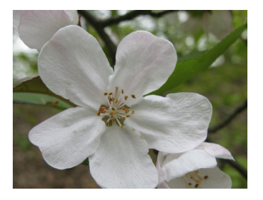
Volume 33 Issue 1