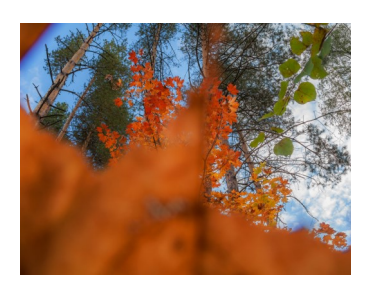
Volume 33 Issue 6

What do you perceive as necessary in life? Of course, our family is important, a job, food, clothing, and a place to live. Besides these things, some people believe pleasure is nec-