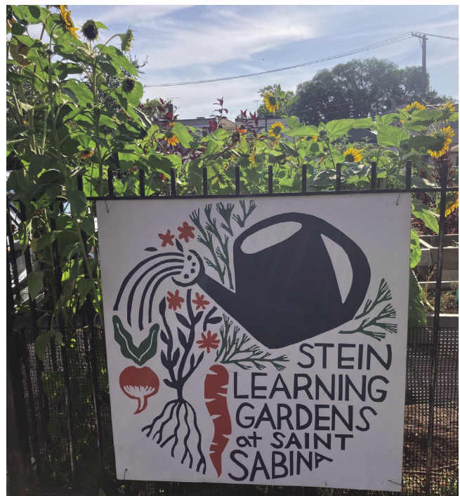
Far left: raised beds in our Nurture Life Gardens; left: Our collaboration Black on Black Love Community Garden at 8616 S. Carpenter; top: Production Manager Marlon English in front of our farmstand; below: original learning garden near 79th and Racine in Auburn Gresham.