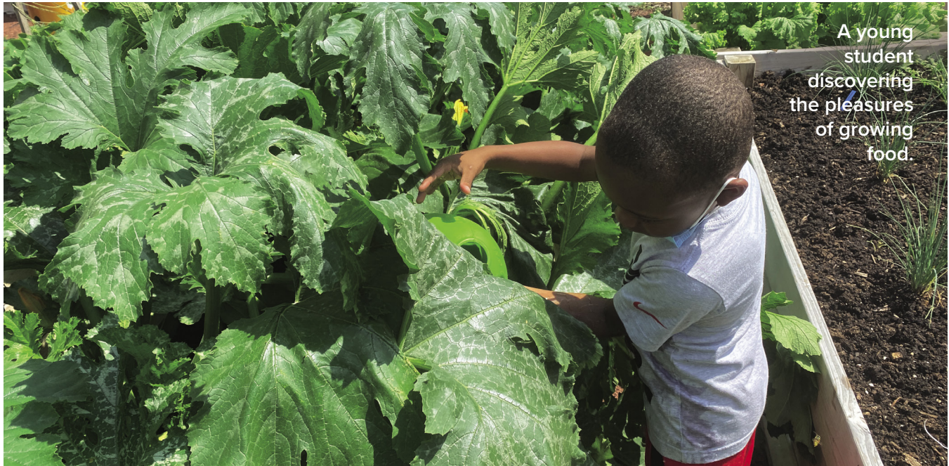
A young student discovering the pleasures of growing food.