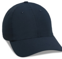
true navy TNV