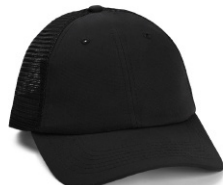
light blue H08