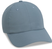
breaker blue BUE