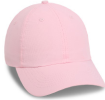
light pink FLP