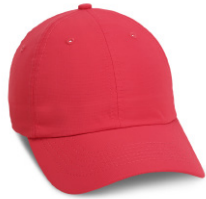
nantucket red NAN