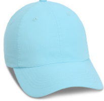
light blue H08