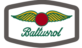
11. IRREGULAR RECTANGLE 2 1.25"W x .8"H 1.1"W x .65"H