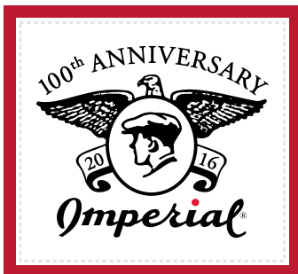
18. LG. SQUARE 1.75"W x 1.6"H 1.6"W x 1.45"H