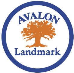
7. MED. ROUND 1.25"W x 1.25"H 1.1"W x 1.1"H