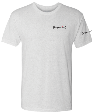
LEFT CHEST: LC AVG SIZING 3-3.5" W