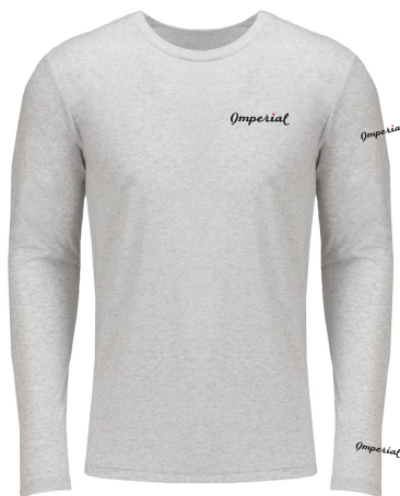
LEFT BICEP: LBI AVG SIZING 2" - 2.5" W