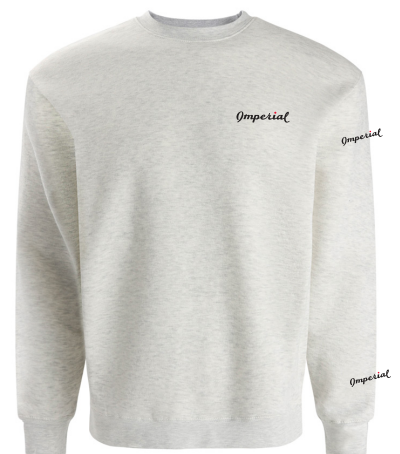
LEFT SLEEVE: 1LS AVG SIZING 1.5 - 2.5" W (1" above cuff)