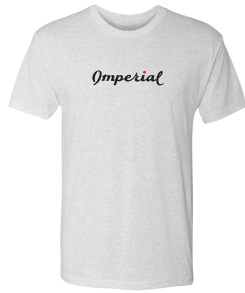
SMALL CENTER CHEST: SCC AVG SIZING 7.5" W