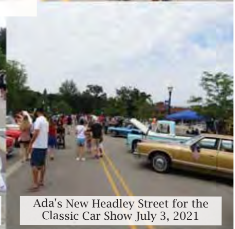
Ada's New Headley Street for the Classic Car Show July 3, 2021