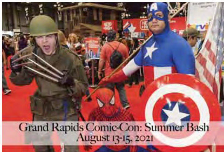
Grand Rapids Comic-Con: Summer Bash August 13-15, 2021

La feria anual de bellas artes y artesanías, Art in the Park, es siempre el primer sábado de agosto en Holland, MI. El evento atrae una de las mayores afluencias de visitantes a la ciudad en un solo día, solo superada por Tulip Time. Hasta 300 artistas y artesanos de ocho estados exhibirán su trabajo. Art in the Park es la principal recaudación de fondos para apoyar el compromiso de Holland Friends