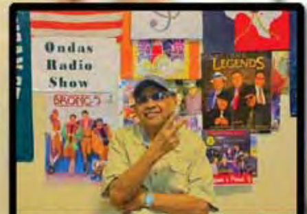
'The New Tejano Wave'