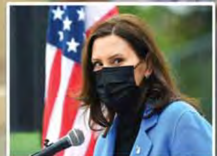
GOVERNOR WHITMER'S POWER UNDER ATTACK

Back to School without Masks? ¿Regreso a la Escuela sin Máscaras?