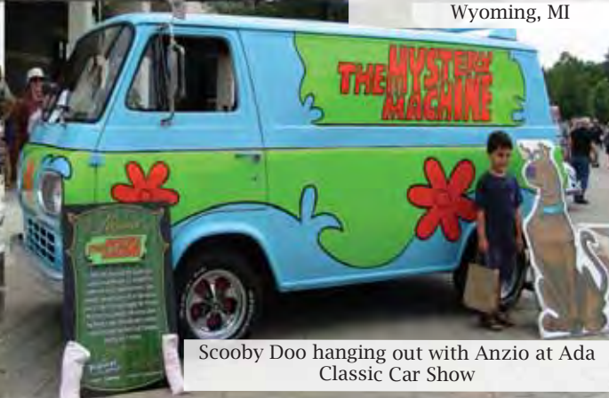
Scooby Doo hanging out with Anzio at Ada Classic Car Show