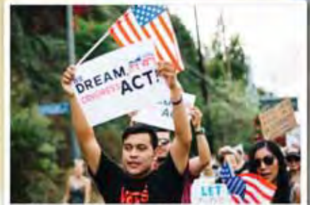
DACA (Deferred Action for Child Arrivals)