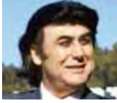
By Jorge Martinez U.S. Veteran

Mob violence has been used to maintain white supremacy since Reconstruction in 1867 when KKK and others used lynching to control black people and maintain systematic political terrorism. Republicans willfully overlook 5000-recorded lynchings and 100s that will never be known. White mobs have used violence and politics to convince themselves of their superiority. When confronted they pretend history is not linear, forgetting the victim's family will never forget. The source of their avariciousness is a fixation with wealth and power. This malignant greed and propensity towards violence makes them perfect mob members.