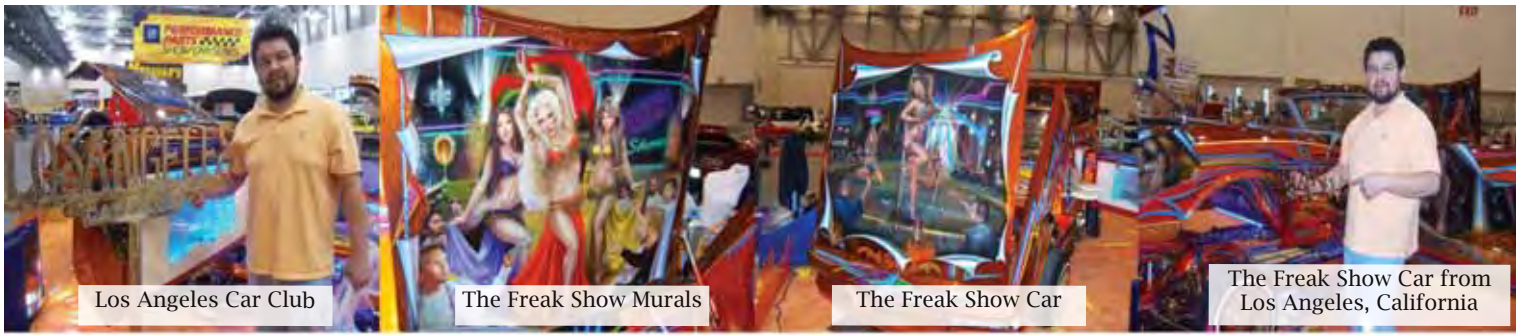
Los Angeles Car Club