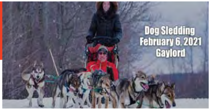
Dog Sledding February 6, 2021 Gaylord

Snowmen on Main Street is a new COMMUNITY contest that allows YOU to express your snowman making talents without using snow! Once you create your masterpiece, drop it off to Grand Haven Main Street ON WEDNESDAY, FEBRUARY 10, between 9am - 12 noon. Once we have your registration (see below) and snowman, GHMS will attach your snowman to one of the light posts within the Grand Haven Main Street District, Washington Avenue from