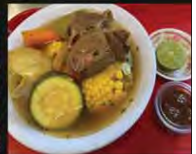
Caldo de Res