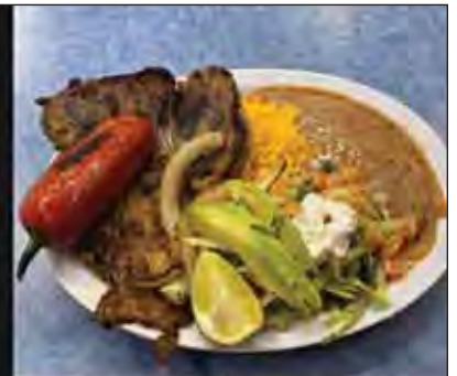
Carne asada con arroz y frijoles (tortillas a mano)