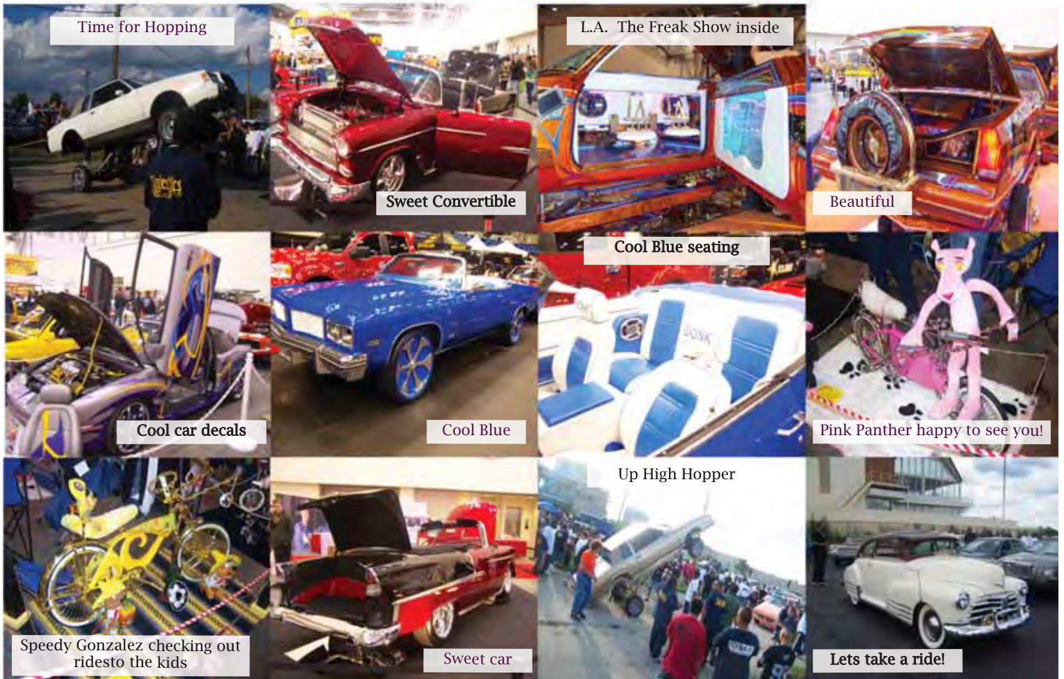
Time for Hopping

Somos pocos pero locos en lowriding! Having a car event? Contact Homer (616)893-3906 deho123@comcast.net