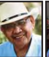
'El Chayo' Cervantes Distribution Lansing