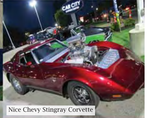
Nice Chevy Stingray Corvette