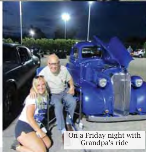
On a Friday night with Grandpa's ride

From Woodland Mall, people were able to get out their lawn chairs to see cars, trucks & motorcycles that cruise up and down 28 th street to Rogers Plaza. It was a great night to see so many cars and meet people.