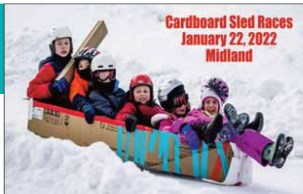
Cardboard Sled Races January 22, 2022 Midland

Do you have what it takes to be king of the hill? After a brief covid-hiatus, Midland Parks and Recreation is excited to announce the 3rd annual Midland Midwinter Chill Cardboard Sled Races at City Forest. The races will take place on Saturday, January 22 from 1 - 4 p.m. at Midland City Forest, 2840 E. Monroe Road, Midland. The schedule of events is: 1 p.m. - Class 1 (Riders 10U); 2 p.m. - Class 2 (Riders 11-17); 3