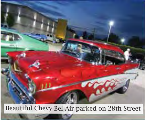
Beautiful Chevy Bel Air parked on 28th Street