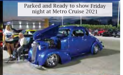
Parked and Ready to show Friday night at Metro Cruise 2021