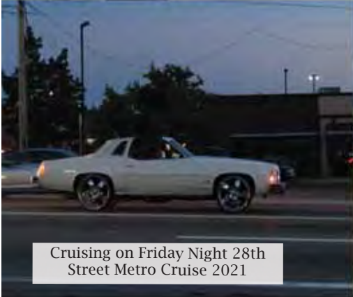
Cruising on Friday Night 28th Street Metro Cruise 2021