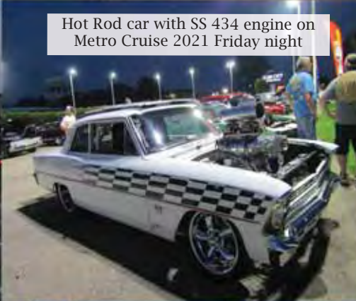
Hot Rod car with SS 434 engine on Metro Cruise 2021 Friday night