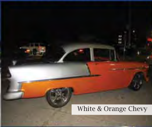
White & Orange Chevy