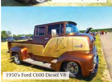
1950's Ford C600 Diesel V8