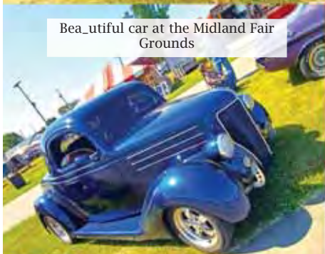
Beautiful car at the Midland Fair Grounds