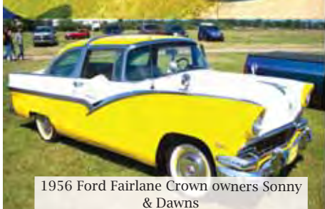
1956 Ford Fairlane Crown owners Sonny & Dawns