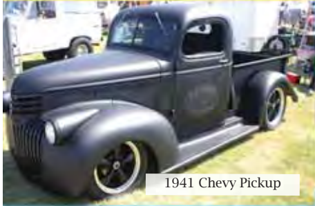
1941 Chevy Pickup