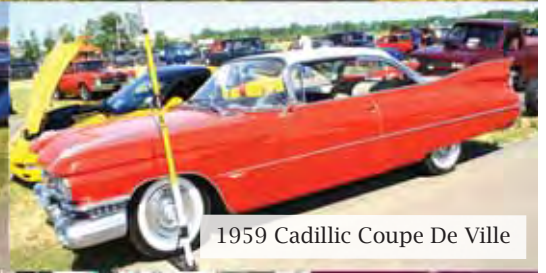
1959 Cadillac Coupe De Ville