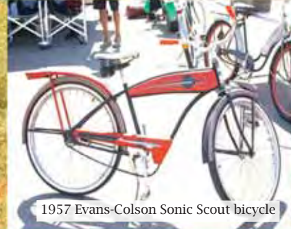
1957 Evans-Colson Sonic Scout bicycle