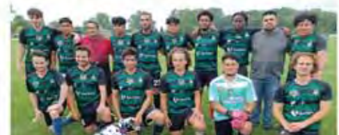
Winners of Soccer Trophy St Joseph Cup - Kalamazoo Soccer Team