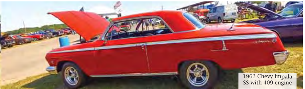
1962 Chevy Impala SS with 409 engine