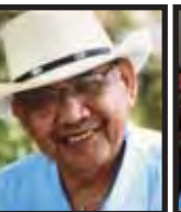
'El Chayo' Cervantes Distribution Lansing