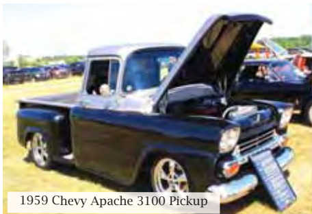
1959 Chevy Apache 3100 Pickup