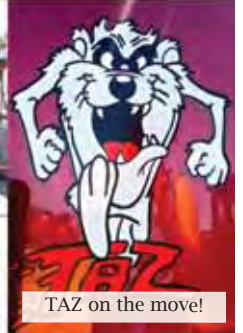
TAZ on the move!