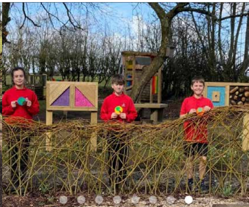
All pupils had the opportunity to make art work for the garden. Here are some of our Year 6 pupils with their pieces.