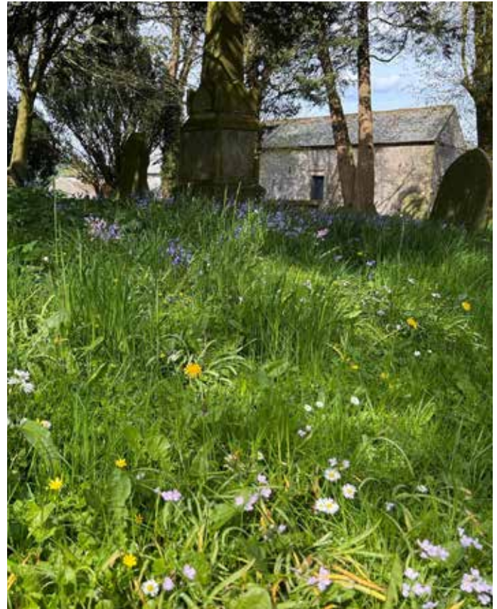
Wildflower meadow is the perfect backdrop to the Church