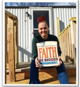
Our new home

In 2018, my life spiraled out of control shortly after giving birth to my son. My husband and I tried meth and what followed was nothing but chaos and confusion. In August 2021, my husband committed suicide, and I lost all understanding for my place in this world. Drinking and drugging, I found myself screaming and crying out to God to let me die. As I laid under a tree in a cornfield staring at His creation my belated husband's aunt found me, and started telling me that Jesus loved me and has a plan for my life. It was truly my John 1:48 moment and He saved me.