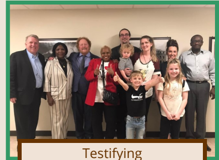
Testifying for House Bill 1028

The Jefferson City News Tribune also stated that Mission Gate serves people inside and outside of prisons across Missouri.