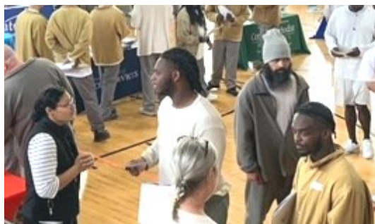
Prison reentry fair